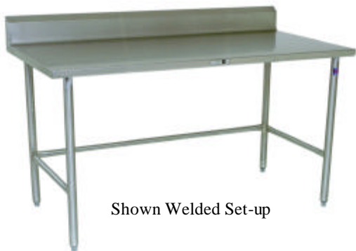
Shown Welded Set-up

w/ 16 Gauge Stainless Steel Work Top w/ Stainless Steel Base and Bracing