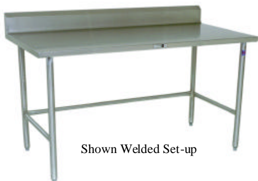
Shown Welded Set-up

w/ 14 Gauge Stainless Steel Work Top w/ Stainless Steel Base and Bracing